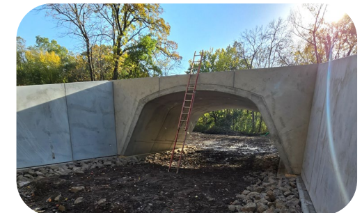
CRDRP Bridge Upgrade (Anoka Co Parks)