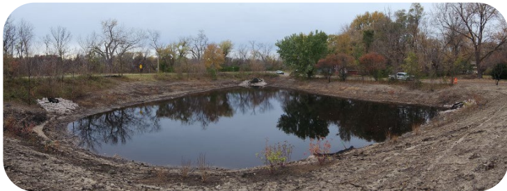
Apex Pond (Fridley)