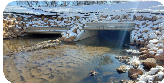
Foley Blvd Enhancement (Coon Rapids)